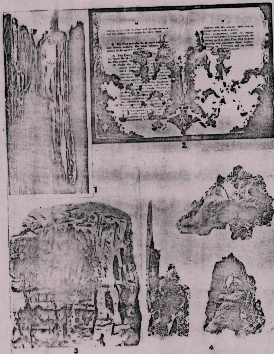
Photographs showing damage to wood and other cellulosic materials by termites.

Fig. 1. Part of a soft-wood (pine) door-piece, showing damage by Heterotermes indicola (Wasmann); Fig. 2. A book damaged by termites; Fig. 3. A piece of wood of bar ( Ficus bengalensis Linn.), showing galleries made by Cryptotermes havilandi (Sjöstedt); Fig. 4. Pieces of wood from a log of unknown species almost completely eaten up by Odontotermes feae (Washman), and covered by it with earth coverings and fillings.