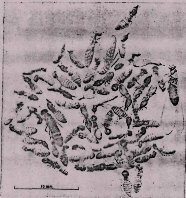
Upper figure : Kaloterмес beesoni Gardner. Imagos (alates) soldiers and pseudoworkers.