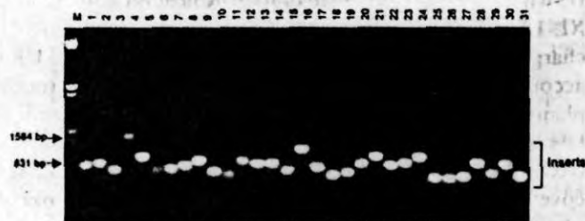
Figure 1. Representative photograph of a gel showing genomic inserts of various sizes from SSR-bearing Hevea clones, amplified using vector-directed T3 and T7 promoter primers. Lanes 1-31, Positive genomic clones for AC and CT repeats; lane M, molecular weight marker ( \lambda -DNA marker/ Eco RI + Hind III).

Sequencing of the positive clones revealed 31 simple repeats harbouring dinucleotide repeats like CT/GA, TG/AC, TA/AT; trinucleotide repeats such as AAG, AGG, AAT; tetranucleotide repeats like AAAT, GAAA, AAGG, ATCC, TAAA and also a pentanucleotide repeat GAAAT motif. The microsatellites frequently contained more than one SSR motif (compound microsatellites), whereas some were simple, perfect and long (Table 1). Majority of the dinucleotide